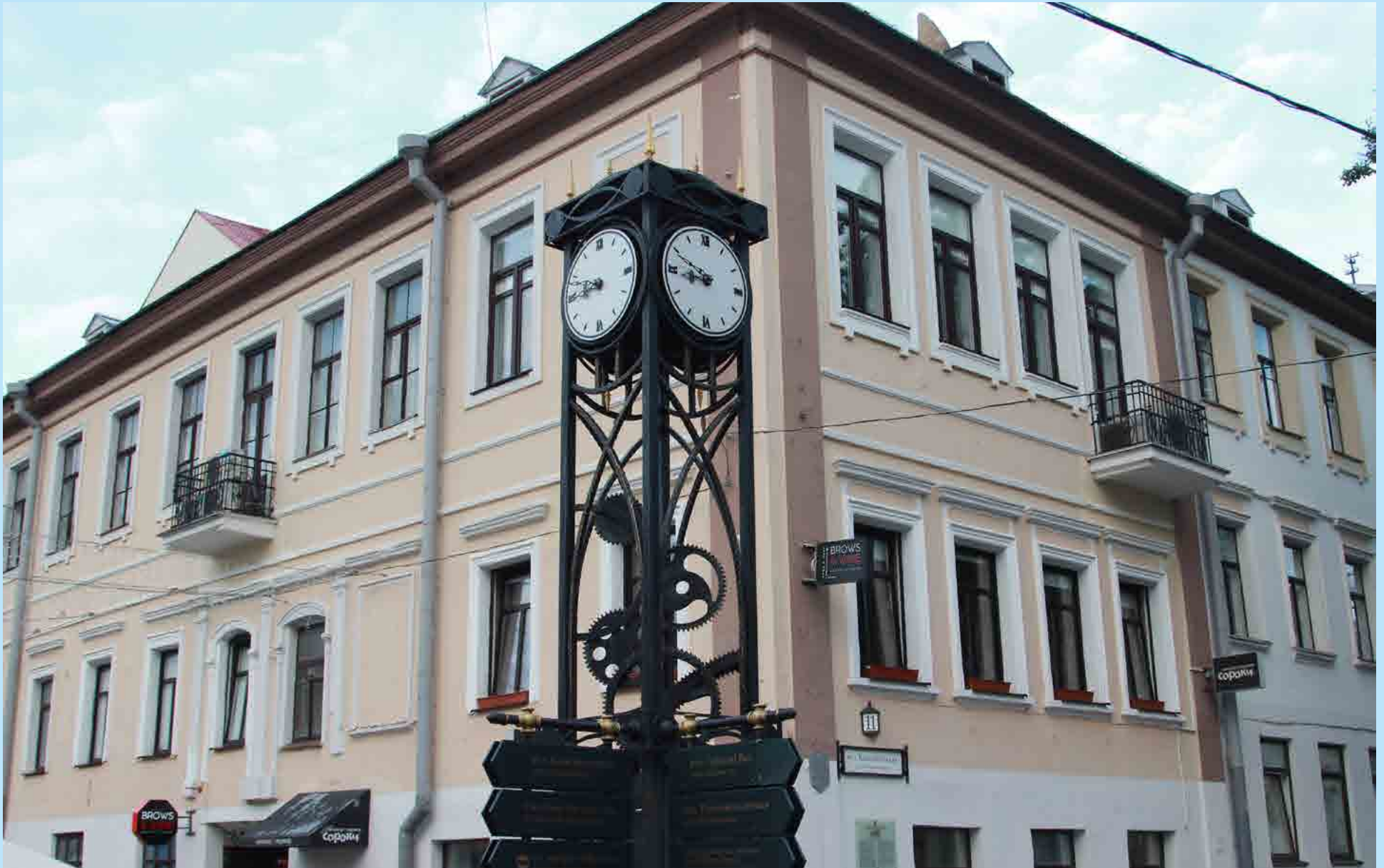
A Jewish Heritage Route through Belarus- The Together Plan: Komsomolskaya Street- Minsk-Belarus