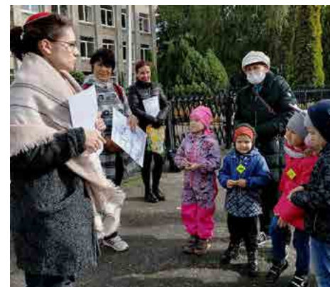
Celebration of the EDJC2021 in Polotsk

If 2018 and 2019 were years of numerical growth and 2020 was the year of the festival's digital transformation, this 2021 has been the year of awareness for dialogue. A dialogue that has been addressed in almost 1,000 activities that have reached 150,000 participants and from a multitude of points of view: Dialogue within the community, Dialogue between generations, Dialogue between Judaism and other faiths, Dialogue between texts and Dialogue between Jewish culture and other cultures.