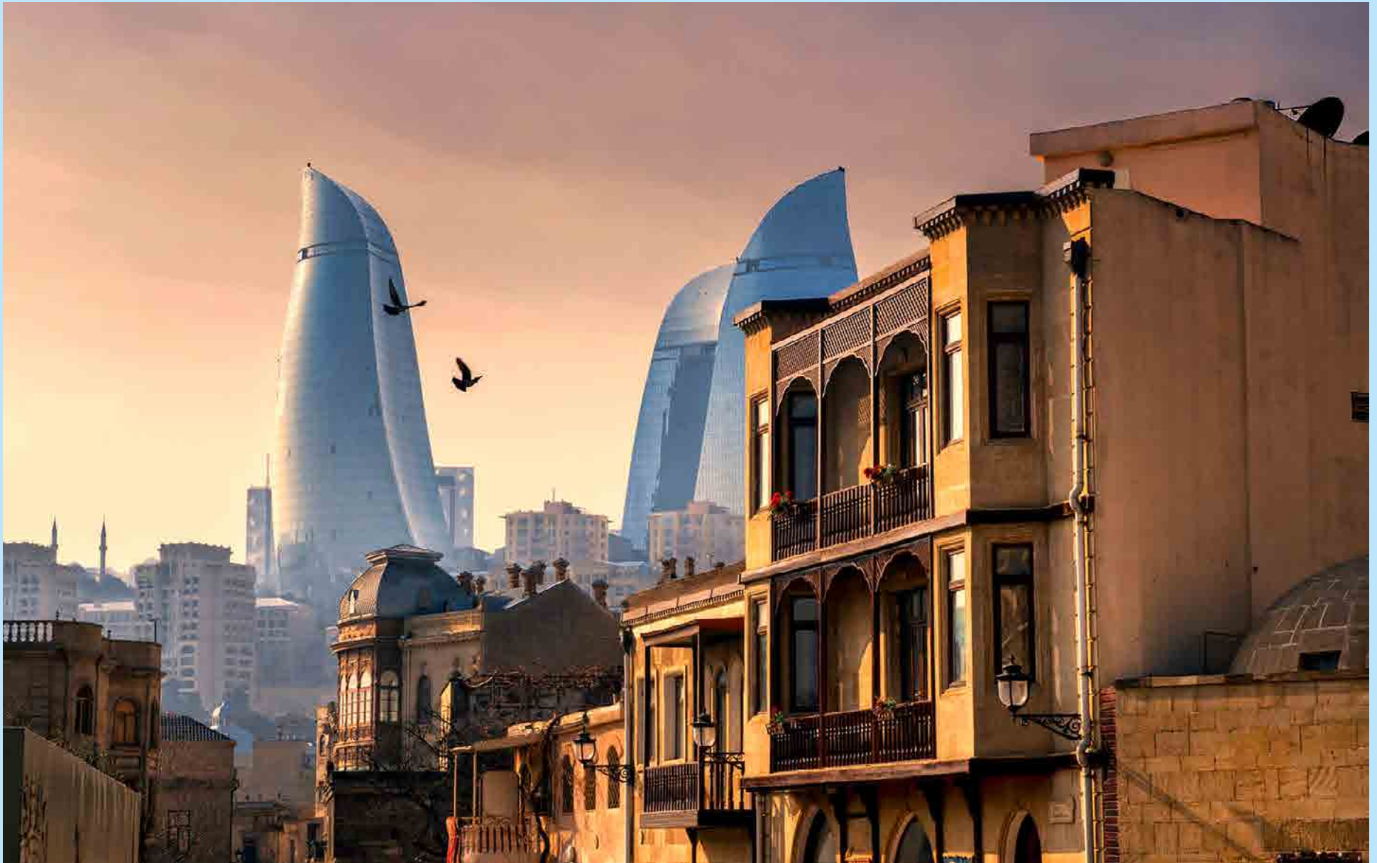
Jewish Heritage Route in Azerbaijan- Azerbaijan Tourism Board: Baku