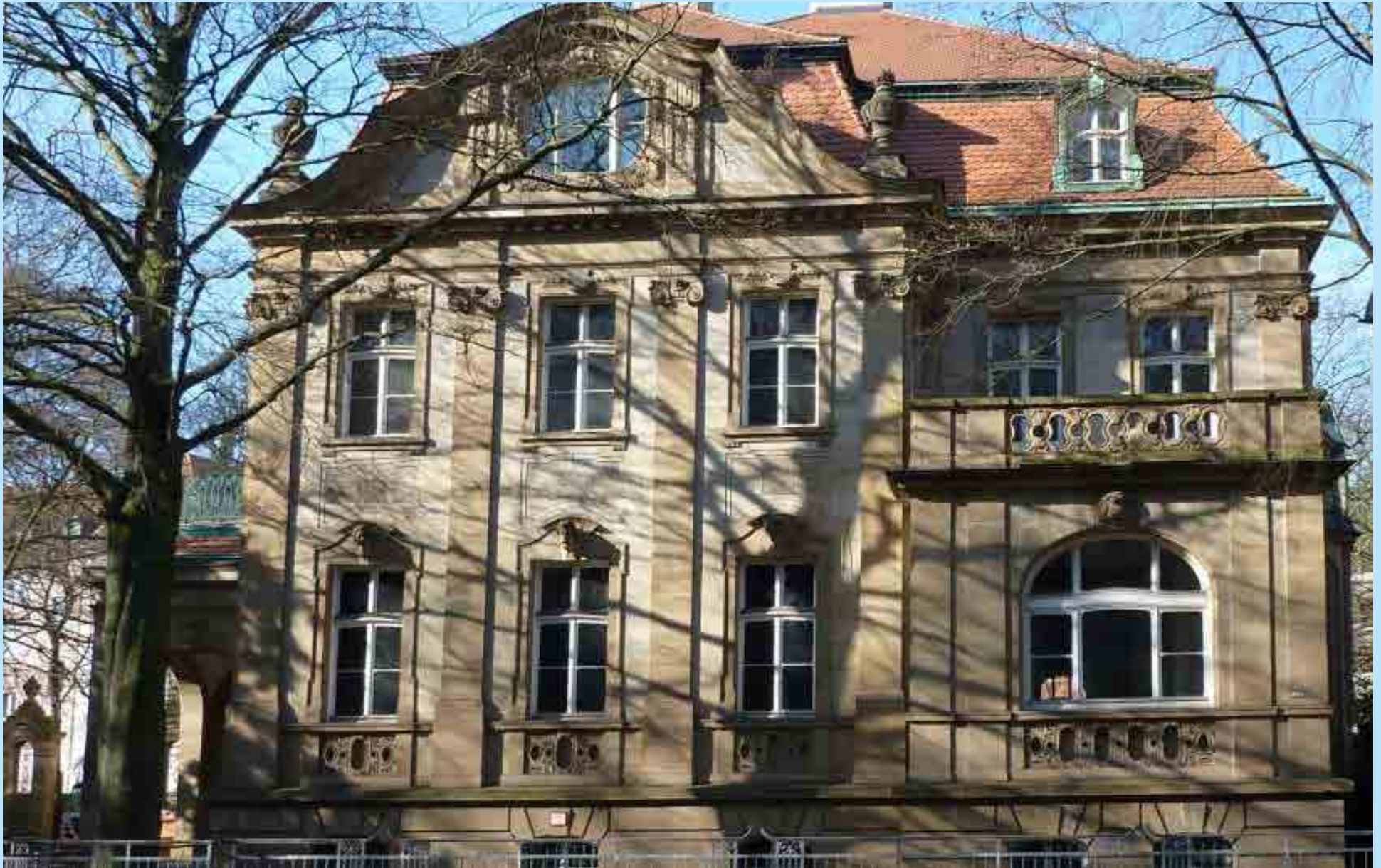
Between Harz, Healt and Weser Jewish life in central Lower Saxony Route. Global Partnership Hannover: House of Jewish Music- Hanover, Germany