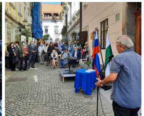
Celebration of the EDJC2021 in Ljubljana