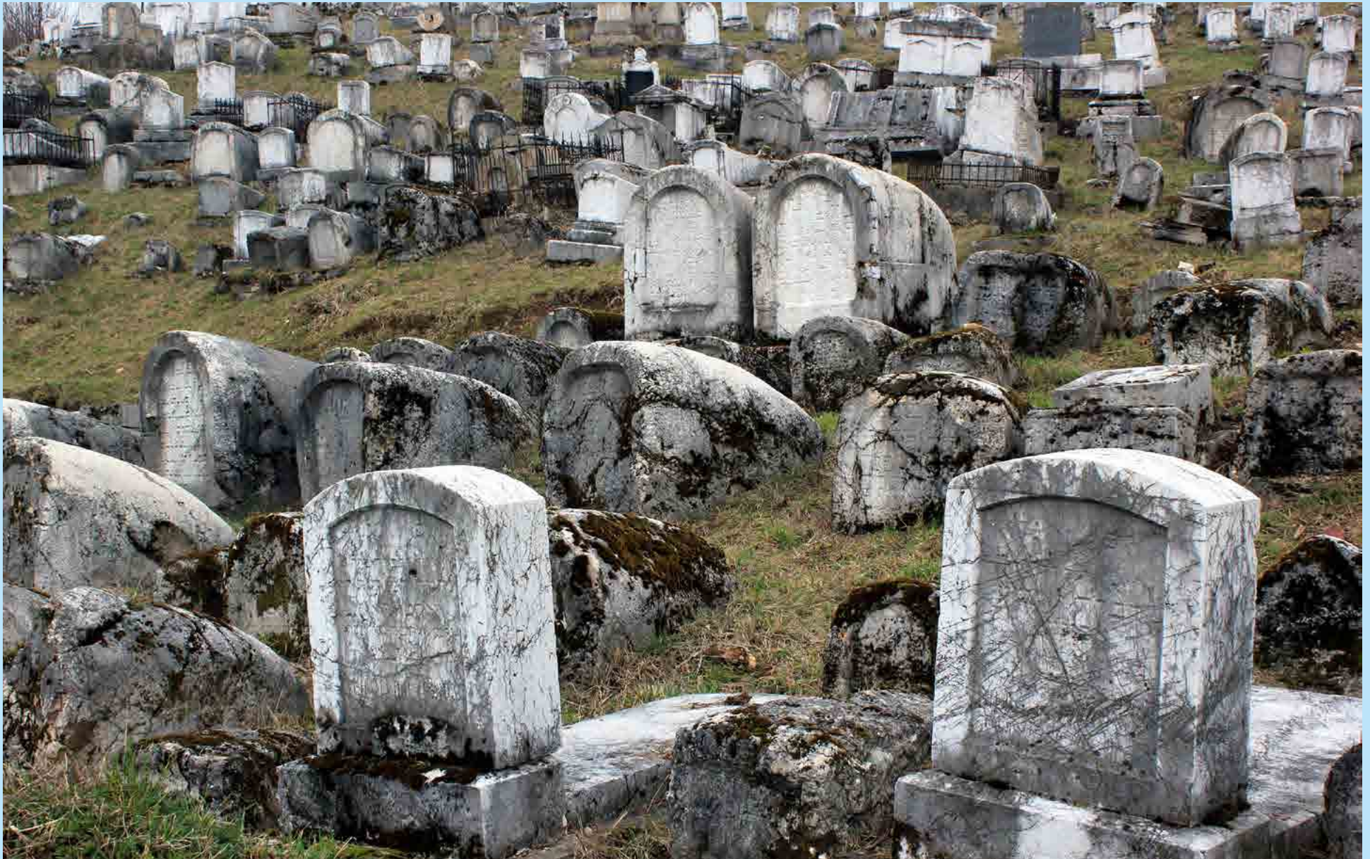
Bosnian Balkan Route- Hagadah Association: Jewish Museum of Sarajevo- Bosnia Herzegovina