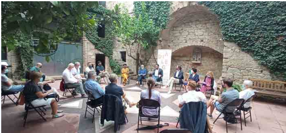
Celebration of the EDJC2021 in Girona

national but also local, to this meeting; from 35 expected participants to more than 150 registered participants in the programme. In addition, all the sessions were recorded and uploaded on AEPJ's YouTube channel, achieving more than 200 views and thus ensuring the dissemination and transfer of the values and objectives of the NOA project far beyond what was planned. Our assessment of the Coordinators' Meeting is extremely positive and the feedback received from the attendees was very enthusiastic.