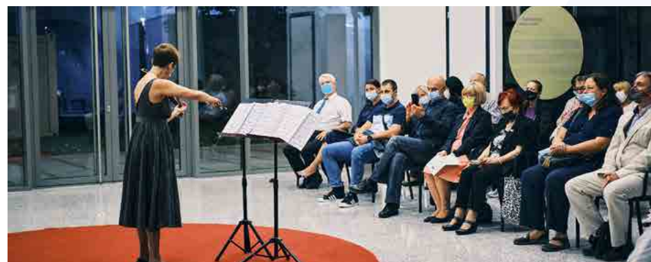
Celebration of the EDJC2021 in Croatia

With an involvement of around 350 cities/institutions, reaching over 150,000 people under the “Dialogue” theme, the project made that 70 institutions to make use of the exhibition materials created by the National Library of Israel on this chosen theme. To achieve this goal, the AEPJ, acting as programme coordinators, provided support and training to more than 400 Jewish cultural institutions across Europe with the aim of ensuring the correct implementation of the “Dialogue” theme and inspiring them to use it as a method and purpose. In addition, AEPJ awarded up to 33 grants to help these institutions implement the exhibition materials created by the National Library of Israel, providing a volume of grants amounting to €16,500. This exhibition addressed the idea of “Dialogue” and Jewish culture from 5 different points of view and in 5 different directions: Dialogue between Jews within the community, Dialogue between generations, Dialogue between Judaism and other faiths, Dialogue between texts and Dialogue between Jewish culture and other cultures.