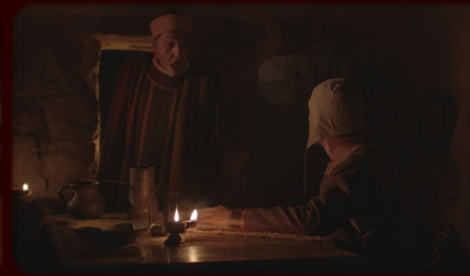
Frames from this documentary